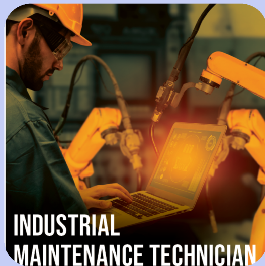
INDUSTRIAL MAINTENANCE TECHNICIAN