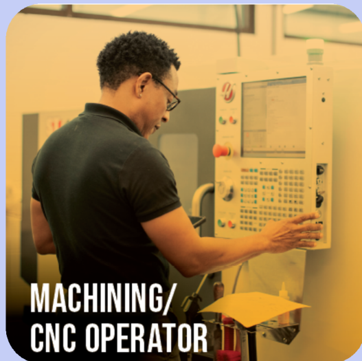
MACHINING/ CNC OPERATOR